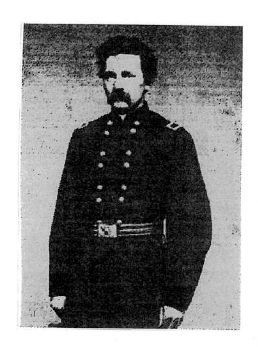
General Stone about 1864