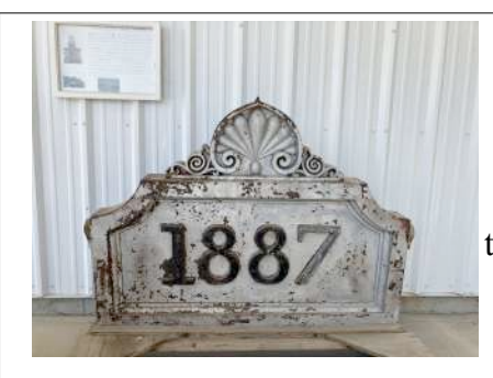
From the orginal Burlington Railroad Bridge that was replaced in 19

The Lewis & Clark Expedition camped nearby in 1804 when this region was part of the new Louisiana Purchase. Two historical markers at Rulo describe this.