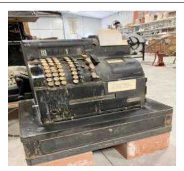
Cash register from the first Rulo Bridge toll booth. Bridge was dedicated in 1939. Became tollfree in 1957.

By 1885, it was known to offer watch repair, blacksmithing, attorneys, bakery, grain mills, breweries, lumberyard, restaurants, hotels, general stores, saloons, drug store, two barber shops, grocery stores and churches. Streets were graveled in 1926. First Street was blacktopped in 1941.