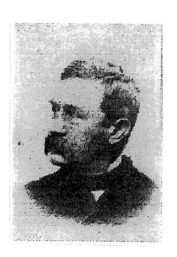
George A. Stone Rulo Mayor 1877 – 1878