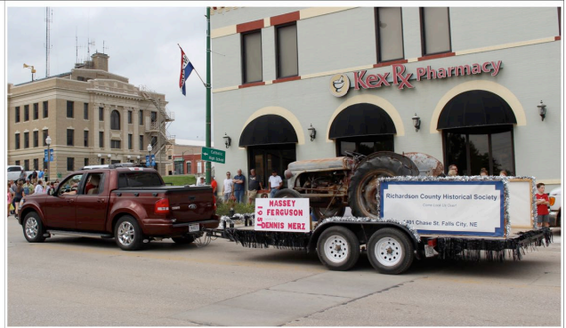
Cobblestone Parade August, 2019