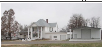
AG Warehouse Building