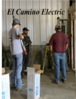
El Camino Electric