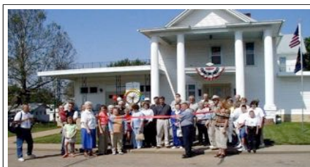
First Building 2003