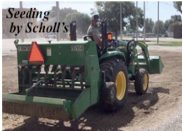
Seeding by Scholl's