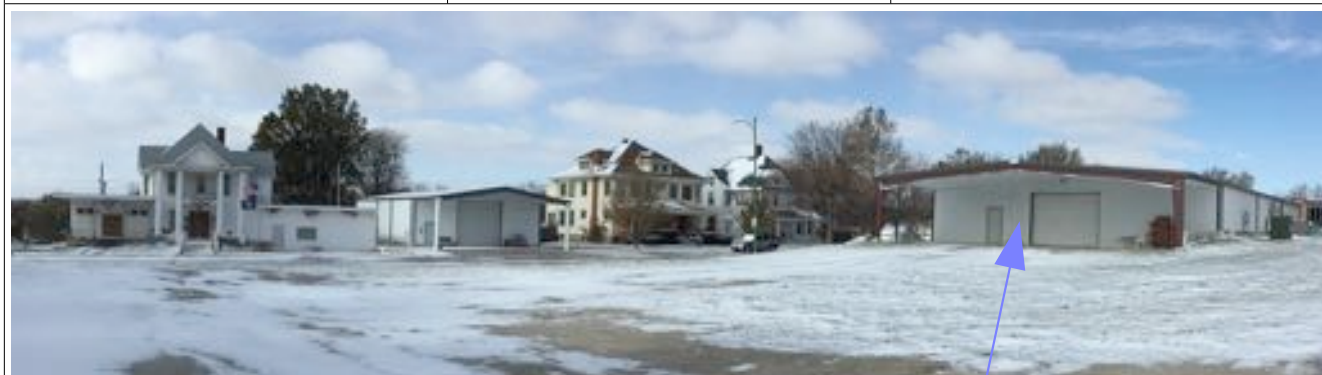
AG II Building Completed September, 2019 !!

Support for mailing this newsletter graciously provided by Falls City Health Care Community.